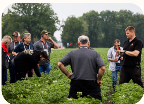
(Copyrights: VDBorne Campus)